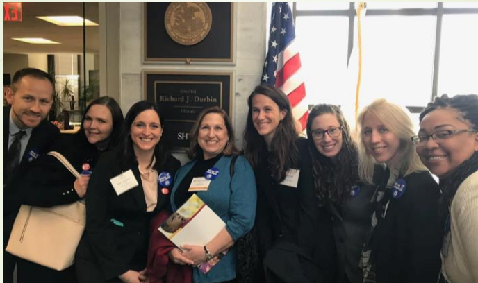
American Academy of Pediatrics Legislative Committee, Illinois Chapter